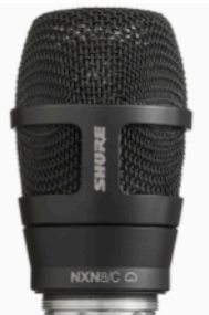
RPW200 Nexadyne 8/C Cardioid Dynamic Vocal Microphone Wireless Capsule for Shure Handheld Transmitters (Black)