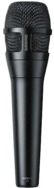
NXN8/C Nexadyne™ 8/C Cardioid Dynamic Vocal Microphone