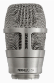
RPW202 Nexadyne 8/C Cardioid Dynamic Vocal Microphone Wireless Capsule for Shure Handheld Transmitters (Nickel)