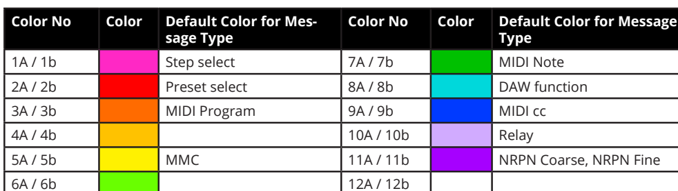
Chart 2 (A=full illumination, b=dimmed)